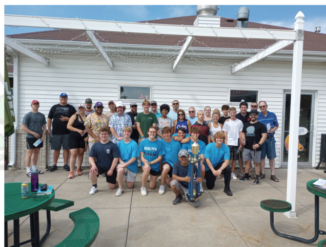
You can sign-up anytime at OmahaPuttersCup.com